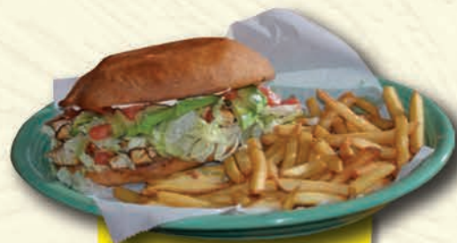
EL MESÓN TORTA

* Consuming raw or undercooked meats, poultry, seafood, shellfish or eggs may increase your risk of foodborne illness, especially if you have certain medical conditions