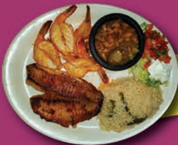
EL JEFE'S PLATTER

Marinated chicken breast grilled, then chopped and cooked with pico de gallo and garlic queso sauce. Served on a bed of poblano rice. $13.99